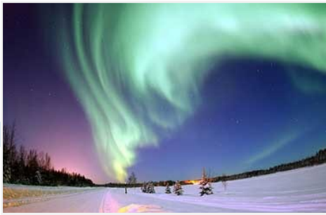
Northern Lights (aurora borealis) shining above Bear Lake, Alaska.

Alaska is one of the best places on earth to see the northern lights – colorful bands of light that dance in the dark night sky. Travelers from all over the world come to Alaska each winter to see this stunning display and take advantage of other winter experiences like snowmobiling, dog